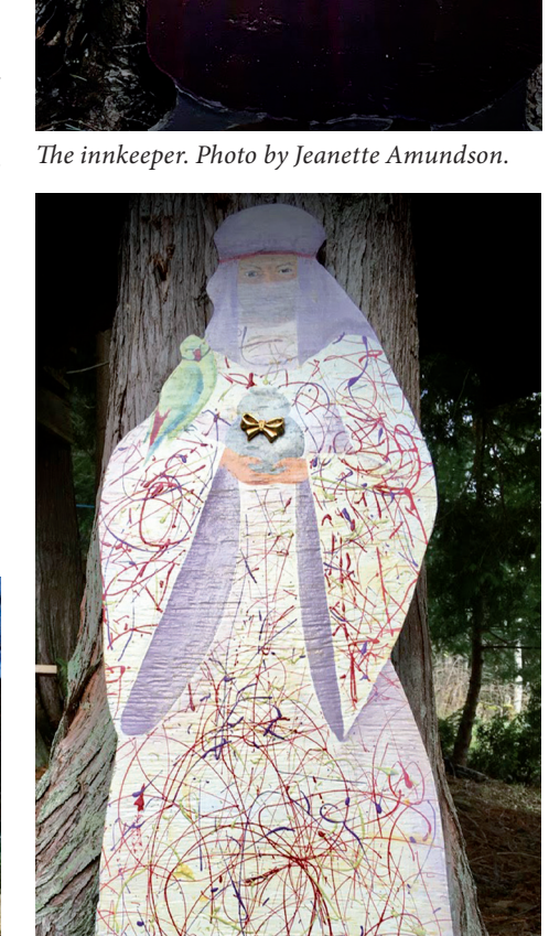
A wise woman.