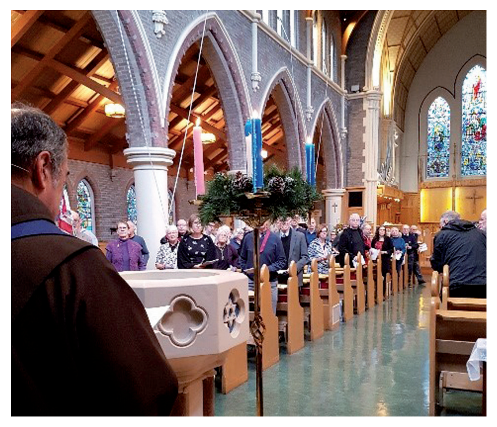
Lighting the Advent candles at St. John the Divine, Victoria.